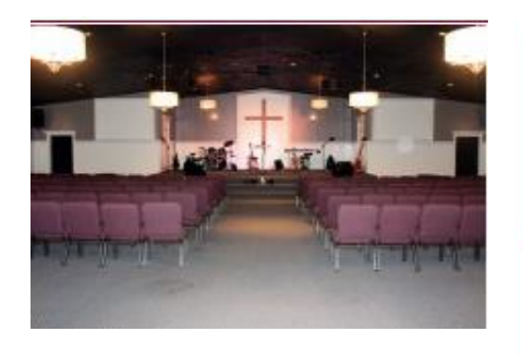
Call to come see!